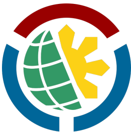
Wiki Society of the Philippines